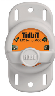
MX2204 Temperature Depth rating 5000 ft

► For complete information and accessories, please visit: www.onsetcomp.com