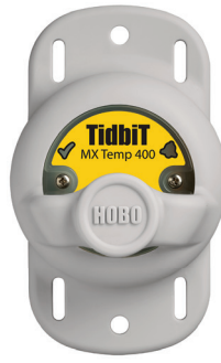
MX2203 Temperature Depth rating 400 ft