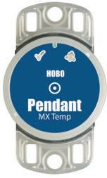
MX2201 Temperature Depth rating 100 ft