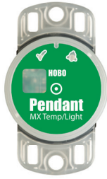
MX2202 Temperature / Light Depth rating 100 ft